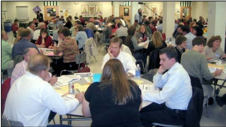
Left: A group discusses the questionnaire at the community dialogue

For each question, individual and group responses are tallied separately, and a summary of those results is included. Additionally, a summary of the individual and group comments is included, as well as all comments.