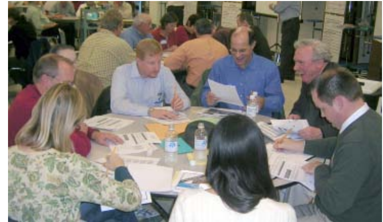
Right: Participants work in small groups to develop a consensus and complete questionnaires