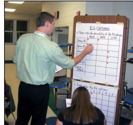
Right: A group representative records his responses at the end of the community dialogue